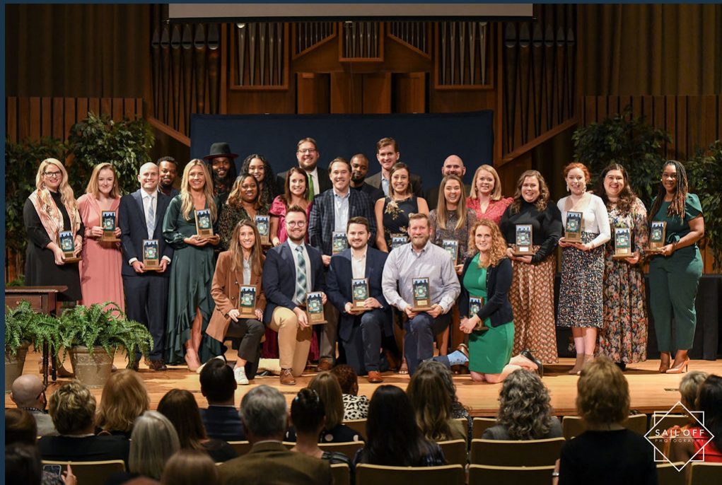
2022 WINSTON UNDER 40 LEADERSHIP AWARD RECIPIENTS

The Winston Under 40 program promotes talent recruitment, retention, and development by offering a broad range of opportunities for young professionals. Focusing on three core goals of leadership development, community involvement, and networking opportunities, the program helps to build our next generation of leaders and create a collective network of young professionals across all industries.