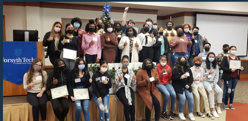
ASPIRE WS INTERNS