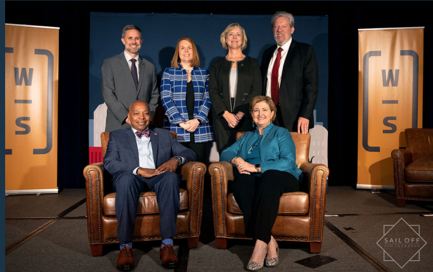
STATE OF EDUCATION