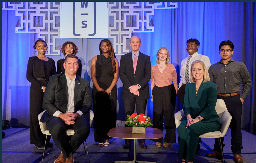
STATE OF EDUCATION | NOVEMBER 2023