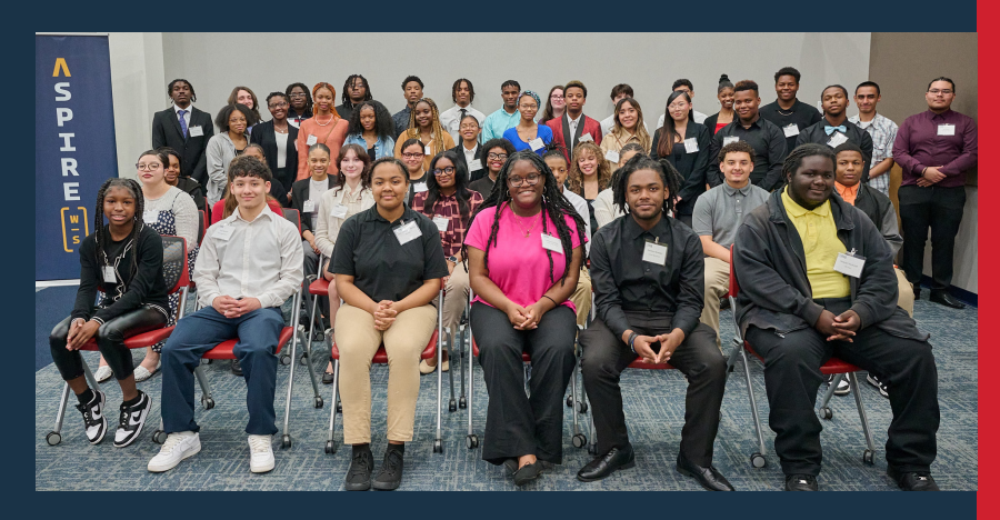
ASPIRE WS WORK-READY CREDENTIAL RECIPIENTS