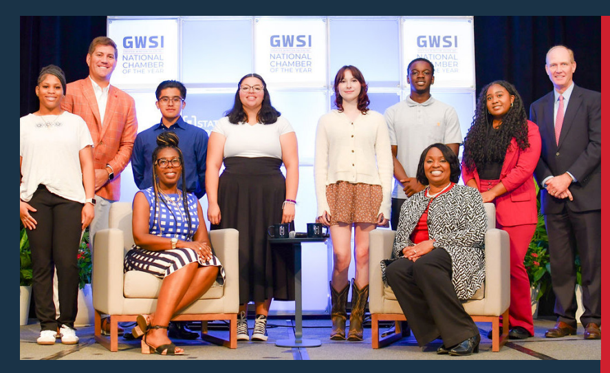
STATE OF EDUCATION 2024 | UNFILTERED PHOTOGRAPHY

2,300+ STUDENTS MENTORED IN SENIOR ACADEMY