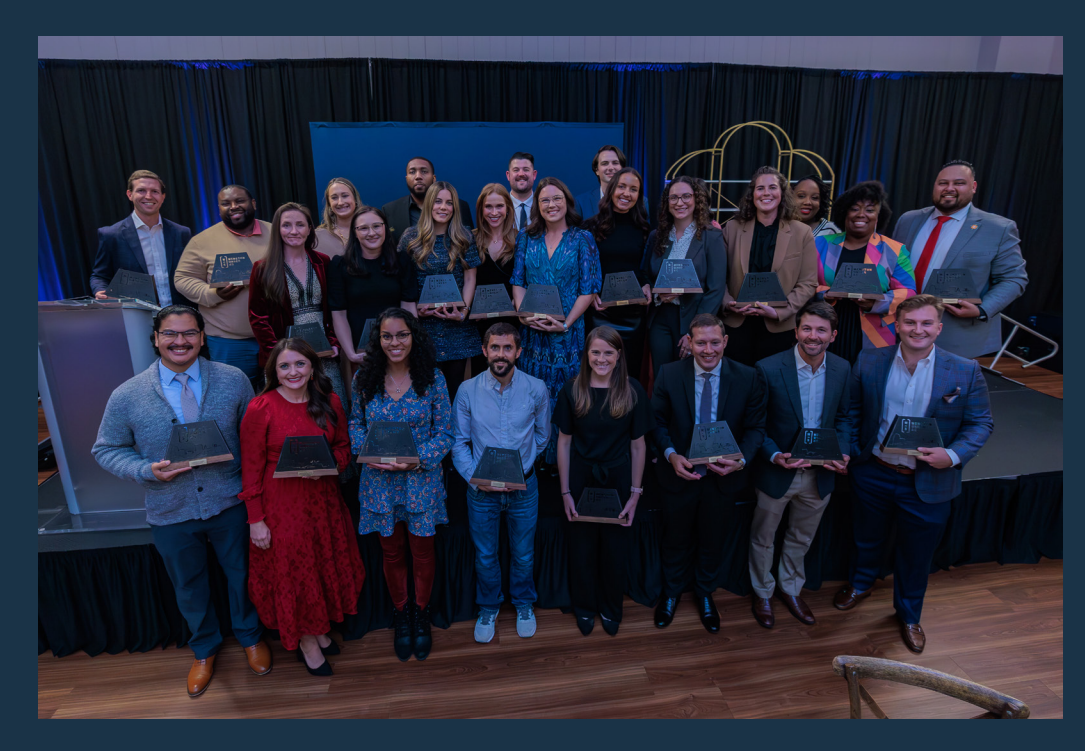
2024 WINSTON UNDER 40 LEADERSHIP AWARD RECIPIENTS

The Winston Under 40 program promotes talent recruitment, retention, and development by offering a broad range of opportunities for young professionals. Focusing on three core goals of leadership development, community involvement, and networking opportunities, the program helps to build our next generation of leaders and create a collective network of young professionals across all industries.