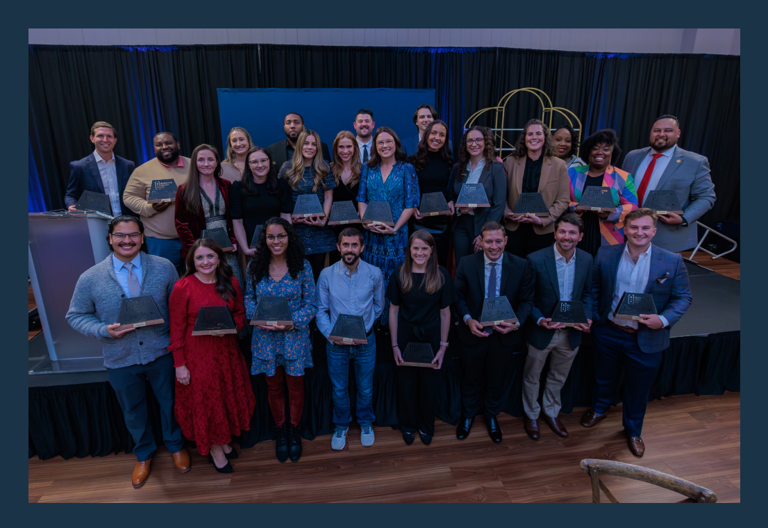
2024 WINSTON UNDER 40 LEADERSHIP AWARD RECIPIENTS

The Winston Under 40 program promotes talent recruitment, retention, and development by offering a broad range of opportunities for young professionals. Focusing on three core goals of leadership development, community involvement, and networking opportunities, the program helps to build our next generation of leaders and create a collective network of young professionals across all industries.