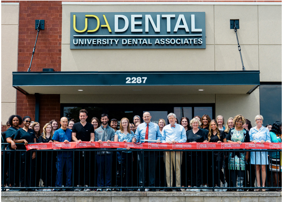
UNIVERSITY DENTAL ASSOCIATES