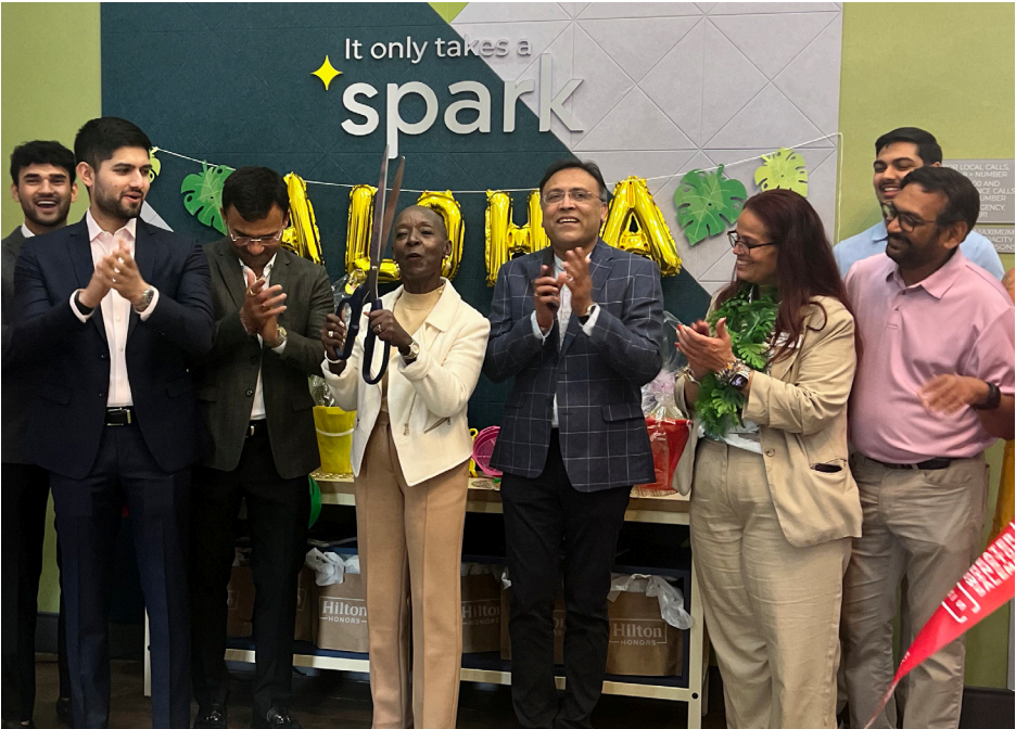
SPARK BY HILTON