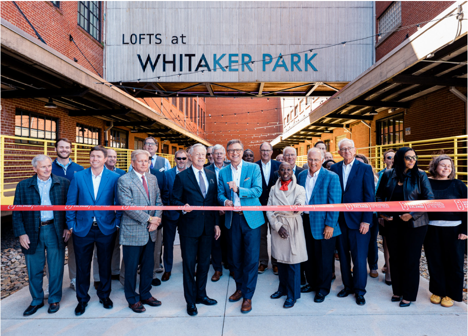
LOFTS AT WHITAKER PARK