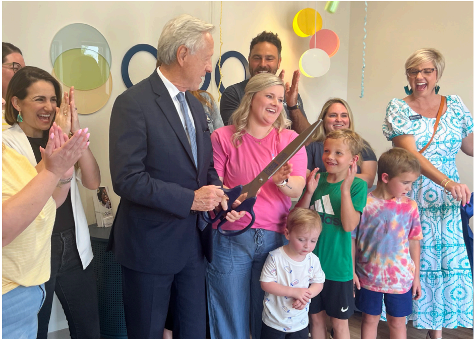
OPAL AUTISM CENTER